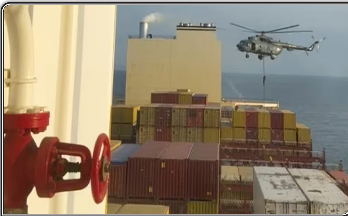
This image taken from a video shows SNSF commandos rappelling from a helicopter down onto the Israeli-linked cargo ship in the Strait of Hormuz on Saturday.

TEHRAN -- Special naval forces of the Islamic Revolution Guards Corps (IRGC) captured an Israeli-linked cargo ship in the Strait of Hormuz on Saturday, days after Tehran said it would retaliate for an Israeli strike on its Syria consulate.