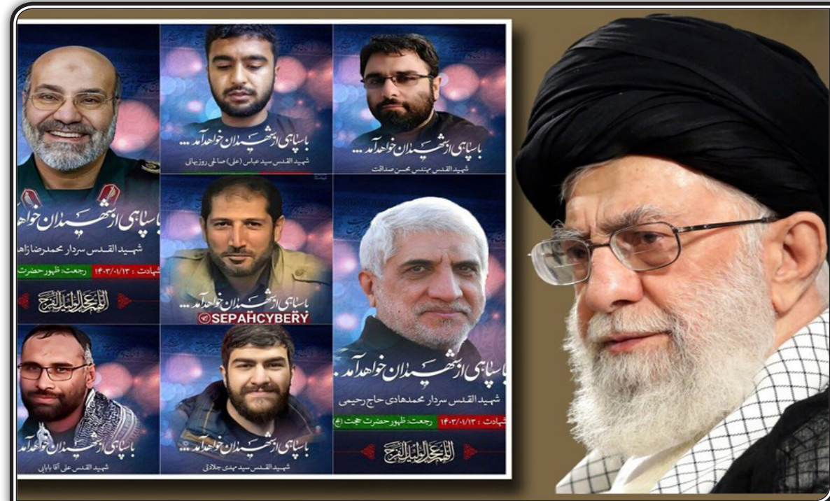
Leader of the Islamic Revolution Ayatollah Khamenei said Tuesday the evil Zionist regime will be punished at the hands of Iran's brave men.