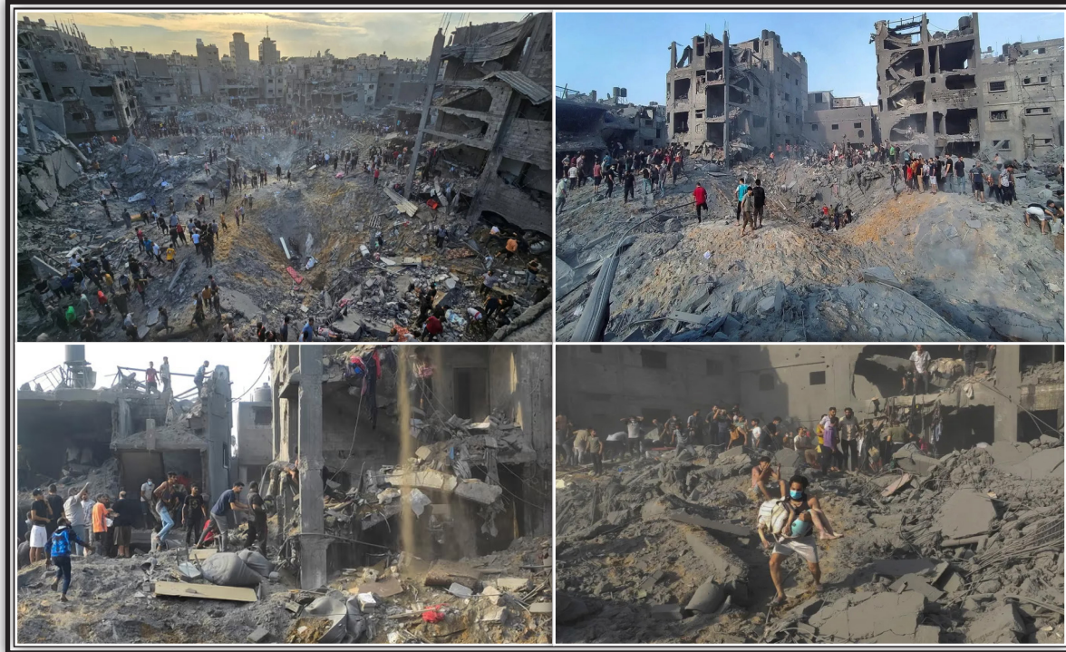
Palestinians search for casualties at the site of Israeli strikes on houses in Jabalia refugee camp in the northern Gaza Strip, on October 31, 2023.

GAZA CITY (Dispatches) -- An Israeli airstrike on the Jabaliya refugee camp in Gaza on Tuesday martyred at least 200 Palestinians, according to Palestinian officials speaking to Al-Jazeera Arabic.