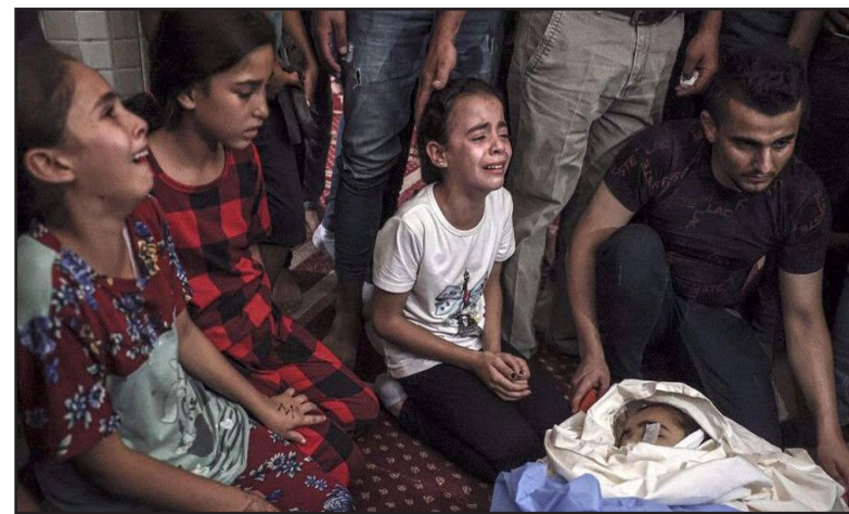
One out of every 200 children in Gaza has been killed in Israeli attacks over the past six weeks.

WEST BANK (Dispatches) – Israel's public broadcaster has published a song featuring a group of children promising to "annihilate everyone" in Gaza.