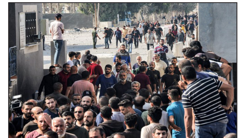
Palestinian workers, who were stranded in Israel since the October 7 attacks, cross back into the Gaza Strip at the Karem Abu Salem commercial border crossing.

Workers crossing into the Palestinian enclave said they were detained and ill-treated by the occupying regime authorities in the