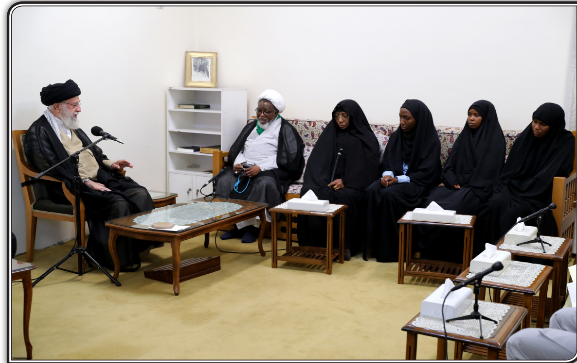
Ayatollah Khamenei meets with Sheikh Zakzaky and his family in Tehran on Saturday.

TEHRAN -- Leader of the Islamic Revolution Ayatollah Seyed Ali Khamenei said Saturday the movement that has started in Palestine will continue and lead to the complete victory of the Palestinians. Ayatollah Khamenei touched on the situation in the Palestinians territories, including the besieged Gaza Strip which is currently under the most ferocious Israeli airstrikes for a seventh day since a Hamas blitzkrieg last Saturday. "Today, one of the manifestations of the power of Islam is the very events that are happening in Palestine," he said during a meeting with prominent Nigerian cleric Sheikh Ibrahim Zakzaky here. "The incidents of the recent days in Palestine, especially the bombings and the martyrdom of women, children and men, injure the heart of every human, but they also show the incredible power of Islam in Palestine," he said. "And with the grace and mercy of God Almighty, this movement that has started in Palestine will go further and lead to the complete victory of the Palestinians," Ayatollah Khamenei said. "Everyone in the Islamic world has a duty to help the Palestinian people." The Leader said the Islamic movement is expanding in different parts of the world such as Africa, Asia, Europe and North America, and "with God's grace,