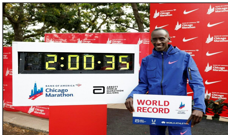
Kenya's Kelvin Kiptum poses next to the clock marking his time after winning the 2023 Bank of America Chicago Marathon in Chicago, Illinois, in a world record time of two hours and 35 seconds on Oct 8, 2023.