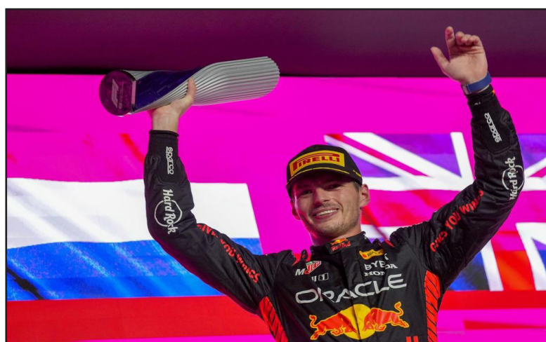
Red Bull driver Max Verstappen of the Netherlands celebrates on the podium after winning the Qatar Formula One Grand Prix auto race at the Lusail International Circuit, in Lusail, Qatar, on Oct 8, 2023.

The relatively slim gap flattered the Australian, with Verstappen never looking like he was under any pressure and also setting the fastest lap.