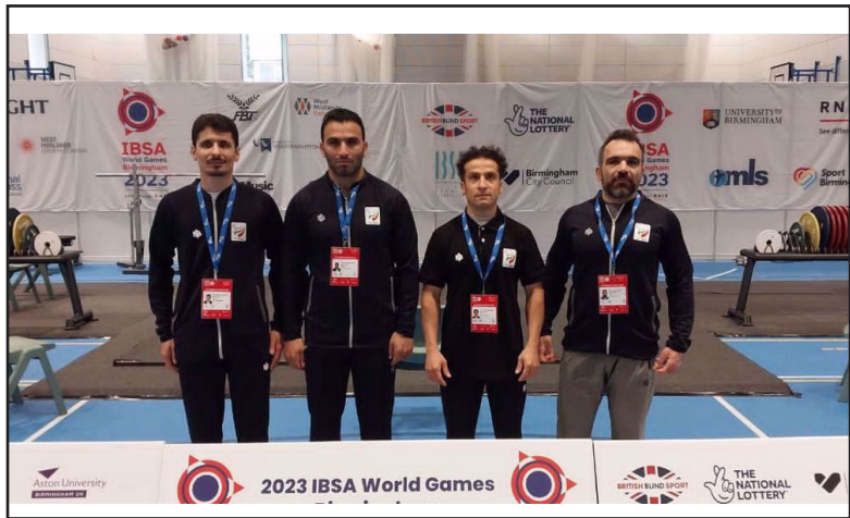
TEHRAN - Visually challenged Iranian athletes have put up a sterling show at the 2023 International Blind Sports Federation (IBSA)

The international sporting event brings together more than 1250 competitors with visual impairment from 70 nations, according to reports.