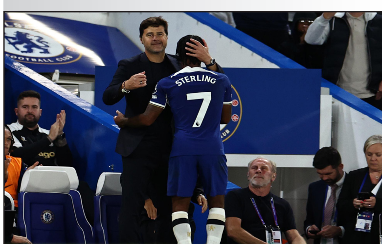
Chelsea's Argentinian head coach Mauricio Pochettino hugs Chelsea's English midfielder Raheem Sterling as he walks off the pitch during the English Premier League soccer match between Chelsea and Luton at Stamford Bridge in London on Aug 25, 2023.

LONDON (Reuters) - Chelsea won their first competitive match under coach Mauricio Pochettino with a 3-0 home victory over Premier League new boys Luton Town on Friday thanks to two goals by Raheem Sterling and Nicolas Jackson's first strike for the Londoners.