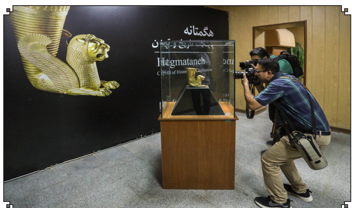
Some 11 artifacts dating back to Sassanid and Achaemenid dynasties were unveiled at Hegmataneh Museum in Hamedan on Aug. 24, 2023. The artifacts kept at the National Museum of Iran have been loaned to Hamedan Museum for a five-day display.