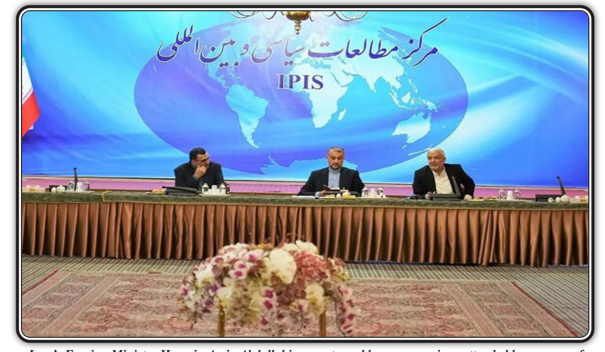
Iran's Foreign Minister Hussein Amir-Abdollahian, center, addresses a seminar attended by a group of professors of political science and international relations held at the Institute for Political and International Studies of the Ministry of Foreign Affairs in Tehran on Tuesday.

TEHRAN - Iranian Foreign Minister Hussein Amir-Abdollahian on Tuesday expressed the Islamic Republic's readiness to negotiate last year's draft agreement aimed at salvaging the 2015 nuclear deal, also known as the Joint Comprehensive Plan of Action (JCPOA), and removing illegal U.S. sanctions.