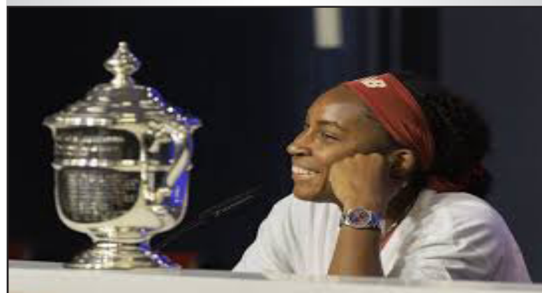
American tennis player Coco Gauff talks to the media after defeating Belarus' Aryna Sabalenka in the Women's Singles final tennis match on Day Thirteen of the U.S. Open at USTA Billie Jean King National Tennis Center.

NEW YORK (Reuters) - American teenager Coco Gauff mounted a fierce comeback to beat Belarusian second seed Aryna Sabalenka 2-6 6-3 6-2 in the U.S. Open women’s final on Saturday and claim her first Grand Slam title in front of adoring home fans.