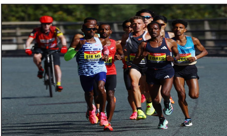
Britain's Mo Farah in action during the run

The 40-year-old Farah, a six-time winner of the Great North Run, was cheered home by spectators lining the course, with fans offering high fives as