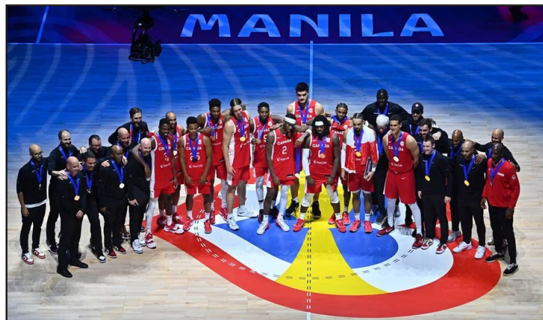
Canada players celebrate with their bronze medals after the match .

Brooklyn Nets forward Mikal Bridges sent the game into overtime by rebounding his own missed free throw and then hitting a corner three with 0.6 seconds to go. Canada’s Kelly Olynyk missed po-