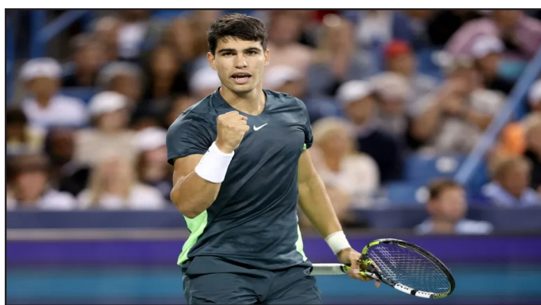
Carlos Alcaraz celebrates during his gruelling Cincinnati Open win over Australia's Jordan Thompson

CINCINNATI (AFP) - Carlos Alcaraz battled through a rain interruption to claim his 50th win of the season, defeating Jordan Thompson