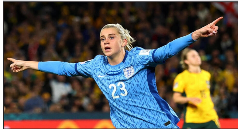
England's Alessia Russo celebrates scoring their third goal against Australia in Sydney on August 16, 2023.

SYDNEY (AFP) - Lauren Hemp and Alessia Russo did the damage late on in Sydney as England shattered Australian dreams Wednesday with a clinical 3-1 win to set up a Women's World Cup final against Spain.