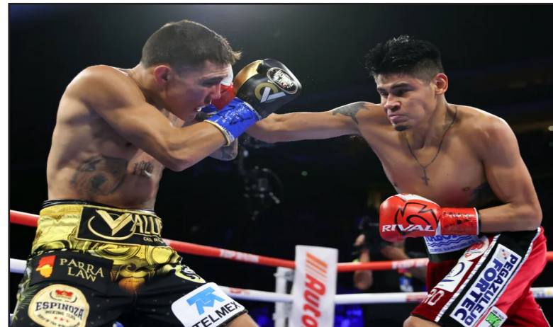
Oscar Valdez (L) and Emanuel Navarrete went to war for 12 rounds Saturday in Glendale, Arizona. Navarrete won by unanimous decision.

ARIZONA (AFP) - Emanuel Navarrete didn't have the high profile that his opponent, Oscar Valdez, enjoyed heading into their bout for the WBO super featherweight title at Desert Diamond Arena in Glendale, Arizona.