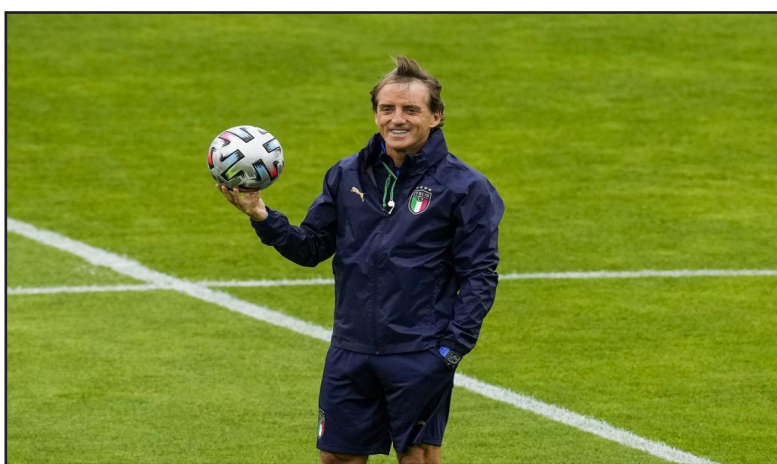
In this file photo dated July 5, 2021, then Italy's manager Roberto Mancini smiles during a training session at the Hive stadium in London, England.

"I will always carry the extraordinary victory of the