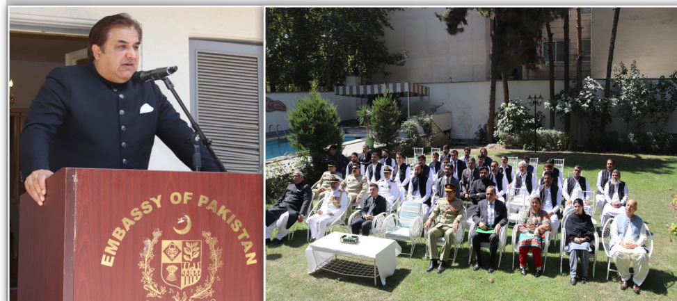
TEHRAN -- An official ceremony to mark the 76th anniversary of Independence of Pakistan was held at Pakistan House Tehran on Monday, attended by members of the Pakistani community in Iran and