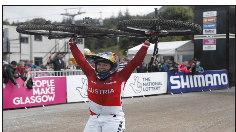
Austria's Valentina Holl celebrates after winning gold in the Women's Elite Final during day three of the 2023 UCI Cycling World Championships at the Ben Nevis Range, Fort William, Scotland, Aug. 5, 2023.

GLASGOW (Reuters) -- Britain's Katie Archibald helped deliver an emotional victory in the women's team pursuit at her home velodrome as her quartet overpowered New Zealand for gold at the UCI World Cycling Championships in Glasgow.