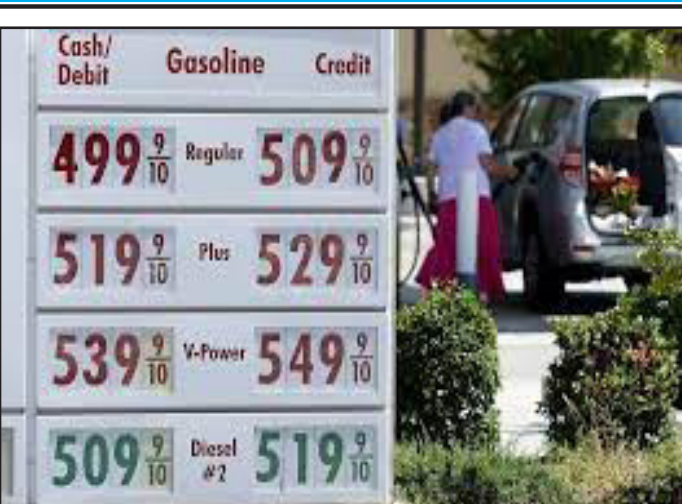
Rising fuel prices in the U.S. are triggering alarm in Washington just as President Joe Biden steps up his bid for re-election by touting lower inflation and the strength of the economy.

Saudi Arabia last week risked angering the White House by