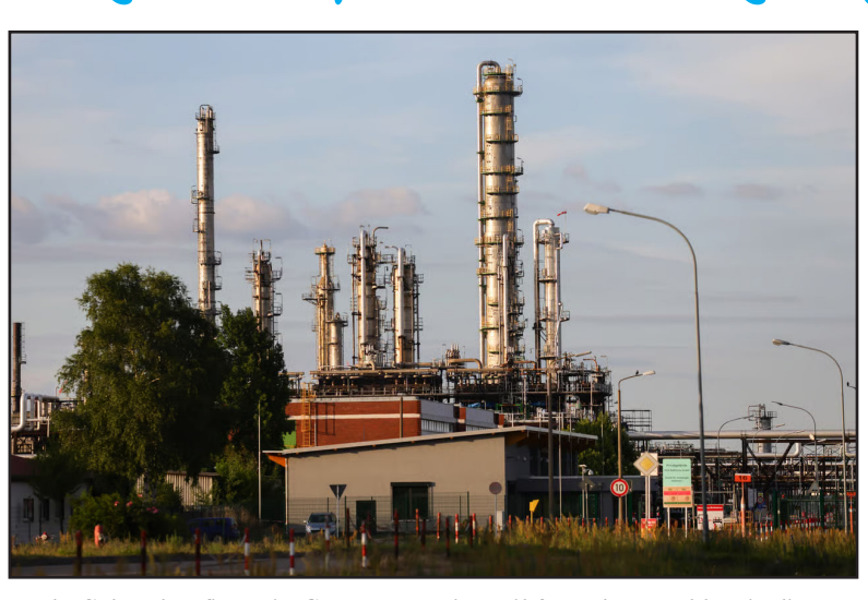
The Schwedt refinery in Germany receives oil from the Druzhba pipeline.

WARSAW (Reuters) – Polish pipeline operator PERN said it had halted pumping through a section of the Druzhba pipeline, which carries oil from Russia to Europe, after detecting a leak in central Poland.