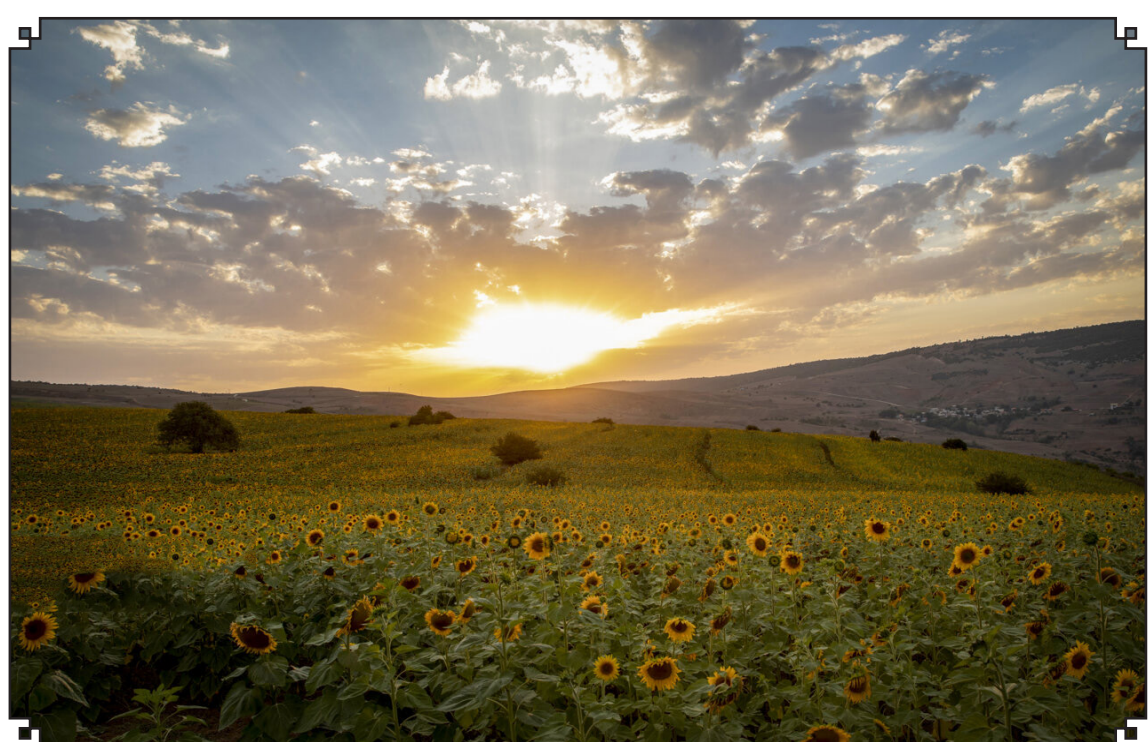
Ashtajenan in Iran's northern Mazandaran province is known for its sunflower farms.