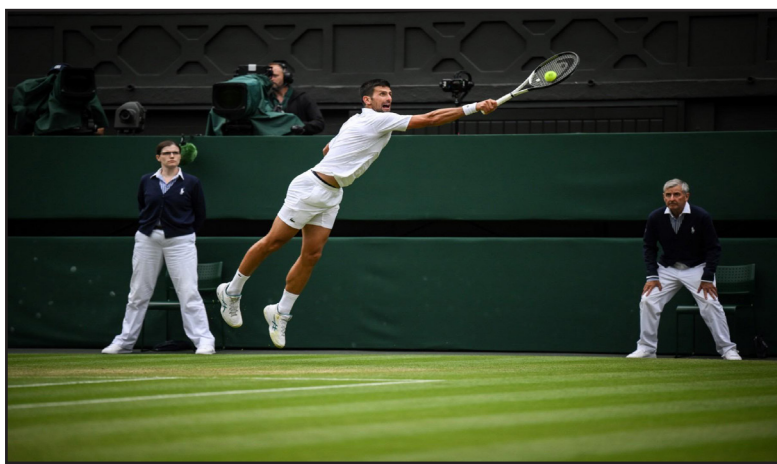
Serbia's Novak Djokovic jumps to return the ball to Russia's Andrey Rublev during their men's singles quarter-finals tennis match on the ninth day of the 2023 Wimbledon Championships at The All England Tennis Club in Wimbledon, southwest London, on July 11, 2023.

But it was not enough to stop the 36-year-old Djokovic reaching his 46th Grand Slam semi-final,