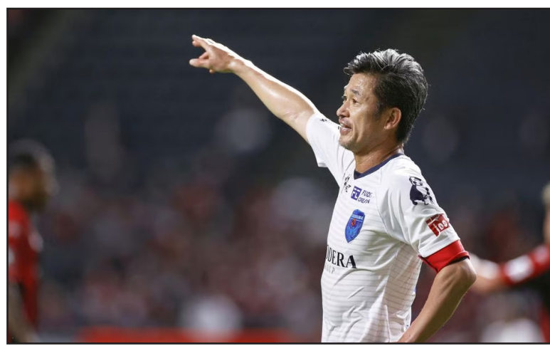
Japanese forward Kazuyoshi Miura

Miura also briefly represented Japan's futsal team in 2012, and was called up for the 2012 Futsal World Cup at the age of 45.