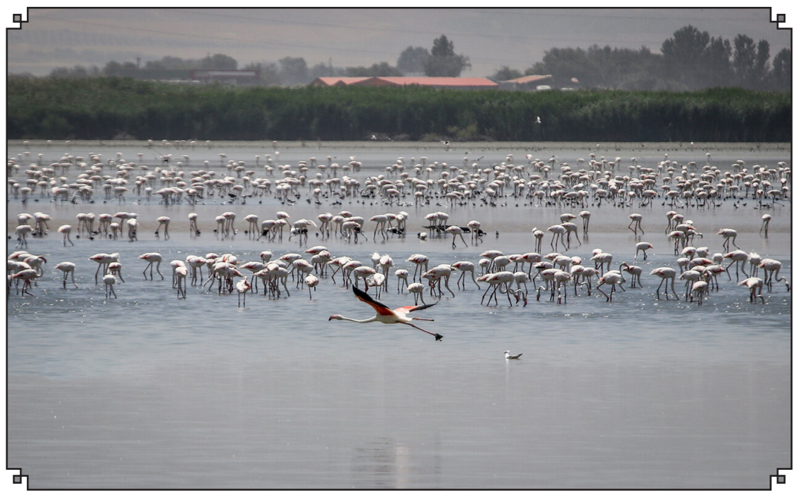
More than 30,000 flamingos have landed in the satellite wetlands of Lake Urmia National Park, such as Sayran Goli, Sulduz and Kani Brazan wetlands.