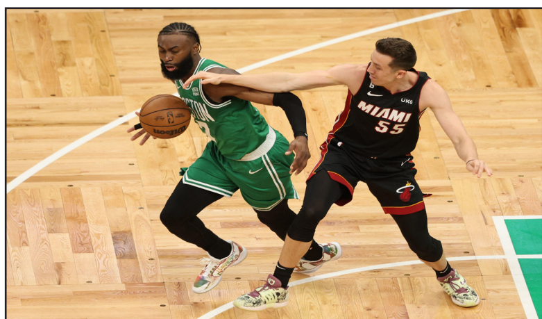
Boston Celtics guard Jaylen Brown (left) is challenged by Miami Heat guard Duncan Robinson during the Game 7 of the NBA basketball Eastern Conference finals on May 29, 2023, in Boston.

BOSTON (Reuters) - The Miami Heat avoided becoming the first team to squander a 3-0 NBA playoff series lead after beating the Boston Celtics 103-84 in Game 7 of the Eastern Conference Finals.