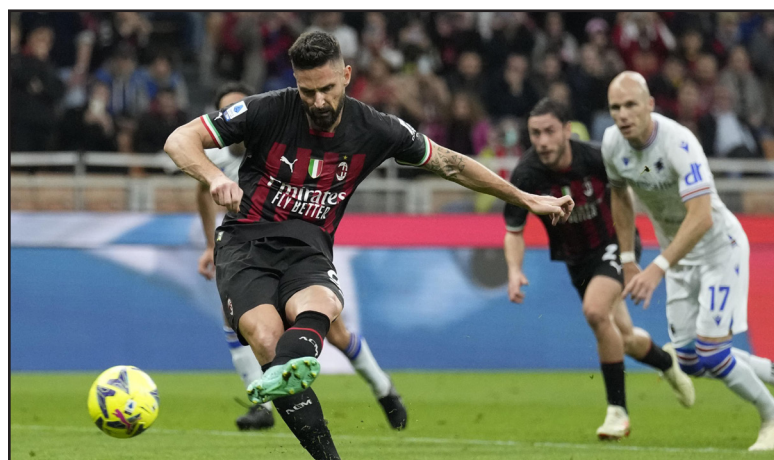
AC Milan's Olivier Giroud scores on a penalty kick his side's third goal during a Serie A soccer match between AC Milan and Sampdoria, at the San Siro stadium in Milan, Italy, May 20, 2023.

after late penalty drama gave it a 1-0 win over Monza, while a crushing late draw with Empoli took Verona's survival battle to the final day.