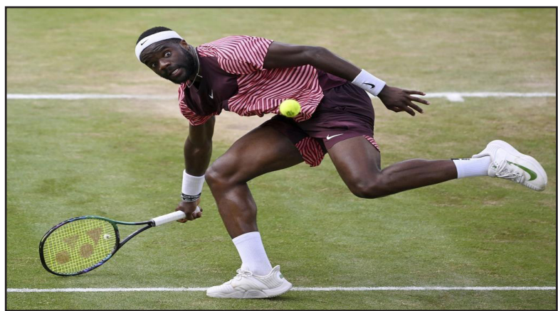
United States' Frances Tiafoe returns the ball to Germany's Jan-Lennard Struff (not in photograph) during the final match of the Stuttgart Open, in Stuttgart, Germany, on June 18, 2023.

STUTT GART (AFP) - Third-seeded Frances Tiafoe survived a