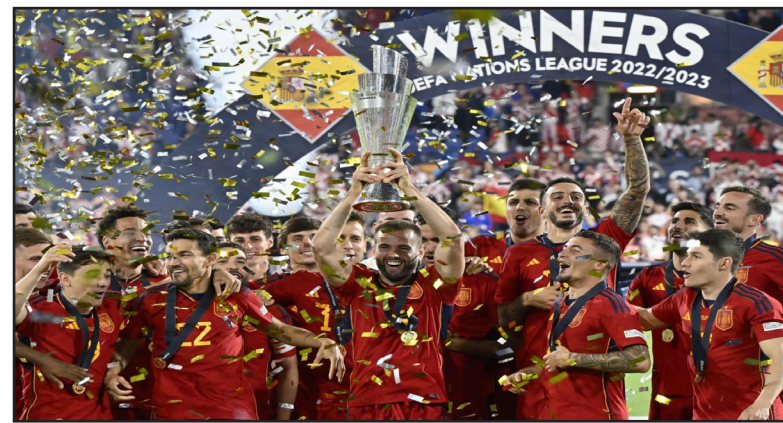
Spain's defender Nacho Fernandez (center) holds the UEFA Nations League Cup as Spain's players celebrate on the podium after winning the penalty shootouts and the UEFA Nations League final football match between Croatia and Spain at the De Kuip Stadium in Rotterdam on June 18, 2023.

ROTTERDAM (Reuters) - Serial winner Dani Carvajal converted the decisive spot-kick to hand Spain a first title in more than a decade as they edged Croatia 5-4 in a penalty shootout to win the Nations League in Rotterdam on Sunday.