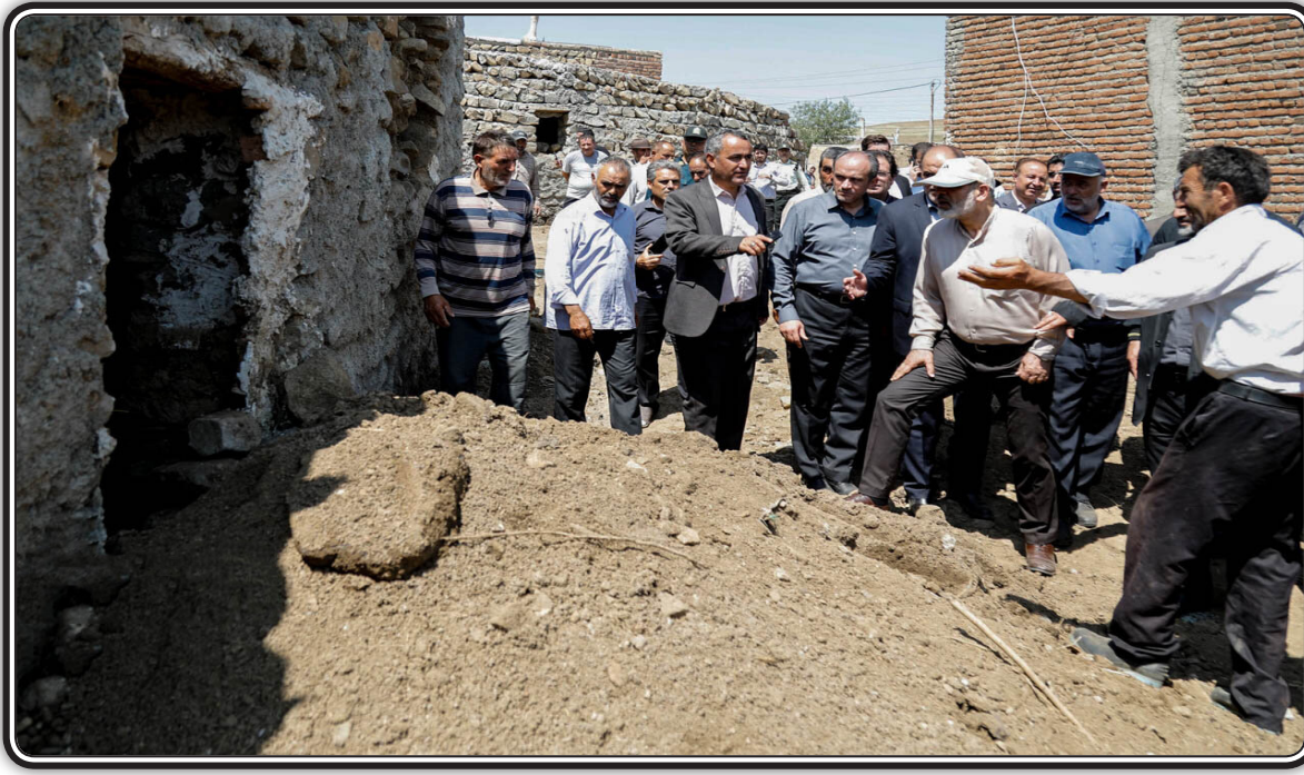
Interior Minister Ahmad Vahidi visits affected homes in the flood-hit Qaleh Barzand village in Germi, Ardabil province on June 19, 2023.

TEHRAN - Several people are dead or missing in severe floods which continued to hit Germi and Bila Suvar in northwestern Ardabil province on Monday.