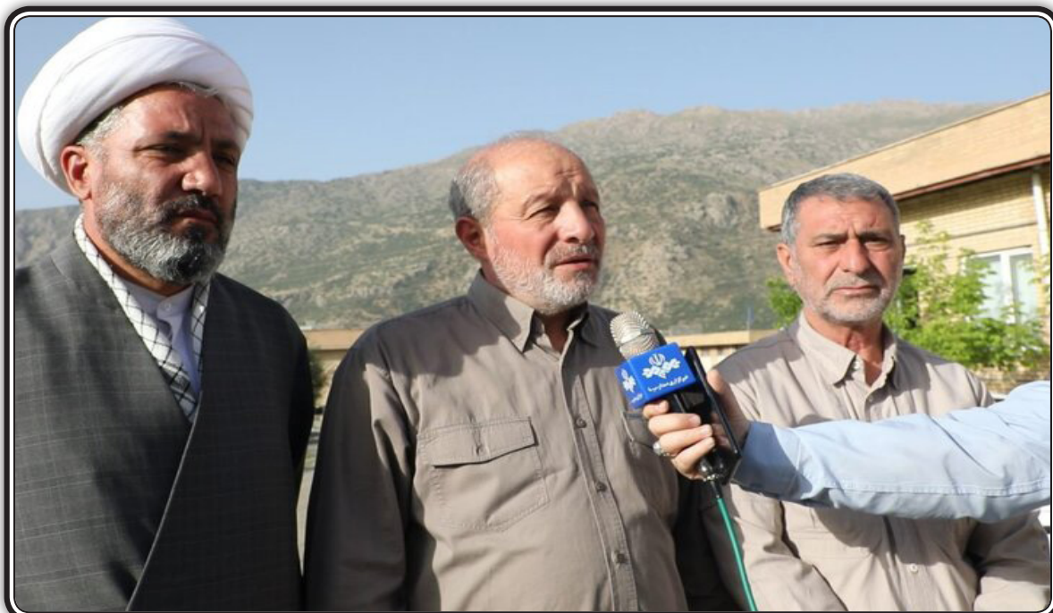
Commander of IRGC's Hamze Sayyid al-Shohada Base General Muhammad Taqi Osanlou talks to IRIB at the site of the drill on Wednesday.

TEHRAN -- The Islamic Revolution Guards Corps (IRGC) Ground Force on Wednesday staged a military exercise in Iran's western province of Kurdistan with the aim of cleansing mountainous areas in Sarvabad city of anti-revolutionary groups.