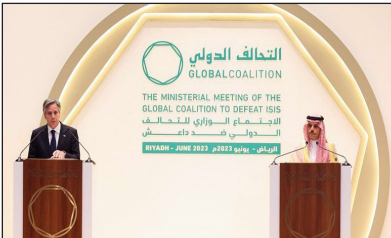
U.S. Secretary of State Antony Blinken attends a joint news conference with Saudi Foreign Minister Prince Faisal bin Farhan Al Saud in Riyadh, Saudi Arabia, on June 8, 2023.

RIYADH (Dispatches) – Saudi officials have snubbed the U.S. secretary of state’s latest push for the kingdom to normalize relations with the Zionist regime and his bid to win further concessions on oil prices and Riyadh’s recent resumption of ties with Syria and Iran during his high-profile visit to Saudi Arabia.