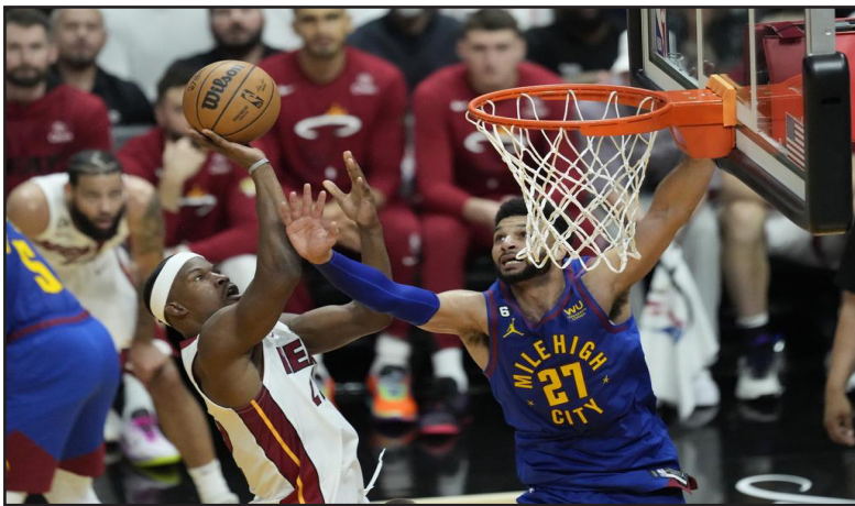
Miami Heat forward Jimmy Butler (22) drives to the basket as Denver Nuggets guard Jamal Murray (27) defends during the first half of Game 3 of the NBA Finals basketball game, on June 7, 2023, in Miami.

the Heat 58-33, and took a 2-1 lead. Game 4 is on Friday in Miami.