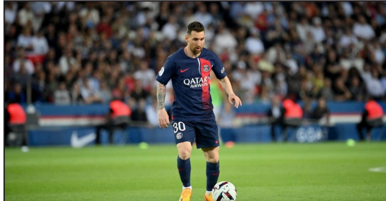
Paris Saint-Germain's Argentine forward Lionel Messi runs with the ball during the French L1 football match between Paris Saint-Germain (PSG) and Clermont Foot 63 at the Parc des Princes Stadium in Paris on June 3, 2023.