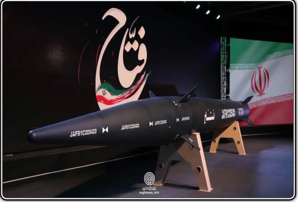
A new hypersonic ballistic missile called "Fattah" with a range of 1400 km, unveiled by Iran, is seen in Tehran, June 6, 2023.

TEHRAN -- Iran has dismissed as "invalid" the meddlesome statements by certain Western countries on its first hypersonic missile, saying the Islamic Republic's missile activities are "conventional" based on international law.