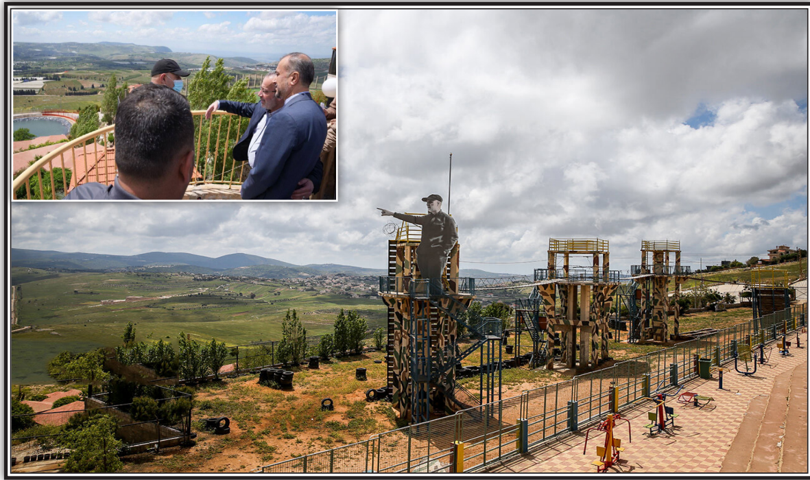
The statue of Gen. Qassem Soleimani at Maroun al-Ras pointing at Occupied Palestine a kilometer away. Inset shows Iran's Foreign Minister Hussein Amir-Abdollahian, left, looking out at Occupied Palestine from Lebanon's border during a tour on April 28, 2023.

BEIRUT (Dispatches) – Iran's foreign minister toured Lebanon's border with Occupied Palestine Friday during a visit to the Arab nation, and was documented looking out at the Zionist-controlled territories.