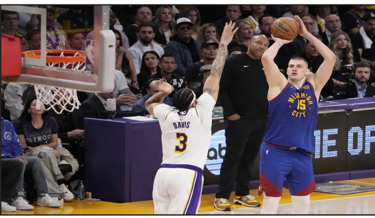
Denver Nuggets center Nikola Jokic (15) shoots over Los Angeles Lakers forward Anthony Davis (3) in the second half of Game 3 of the NBA basketball Western Conference Final series Saturday, May 20, 2023, in Los Angeles.

Kentavious Caldwell-Pope scored 12 of his 17 points in the second half against his former team for the top-seeded Nuggets, who have never been this close to the NBA Finals in 47 years in the league. Denver is making its fifth straight playoff appearance, and the ultimate stage is now