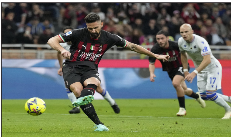
AC Milan's Olivier Giroud scores on a penalty kick his side's third goal during a Serie A soccer match between AC Milan and Sampdoria, at the San Siro stadium in Milan, Italy, May 20, 2023.

Giroud put the icing on the cake five minutes later as the hitman