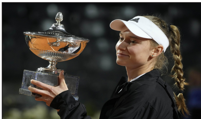
Kazakhstan's Elena Rybakina holds the trophy after winning her final match against Ukraine's Anhelina Kalinina at the Italian Open tennis tournament in Rome, Italy, May 21, 2023.

ROME (AFP) - World number six Elena Rybakina warmed up for the French Open by capturing the Italian Open title on Saturday after her Ukrainian opponent Anhelina Kalinina was forced to retire with an apparent left leg injury while trailing 6-4 1-0.