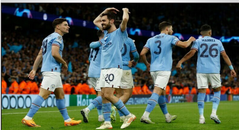
Manchester City's Erling Haaland (right) and his teammates celebrate their third goal during the Champions League semifinal second leg soccer match between Manchester City and Real Madrid at Etihad stadium in Manchester, England, May 17, 2023.

LONDON (Reuters) - Manchester City was confirmed as Premier League champions for the fifth time in six seasons on Saturday without even having to kick a ball after second-placed Arsenal's challenge ended in defeat away at Nottingham Forest.