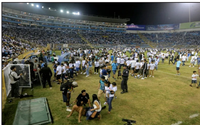
A stampede at a soccer stadium in El Salvador's capital has killed 12 people and injured hundreds.