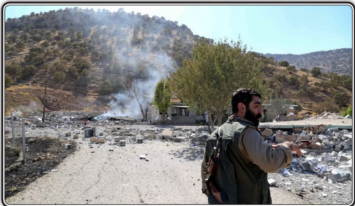
A member of Komala terrorist group stands in the remains of what used to be their headquarters a few hours prior after Iranian missiles and drones struck them in Sulaymaniyah, Iraq on Sept. 28, 2022.

TEHRAN – Iran's security forces have dismantled a terrorist team affiliated with Israel's Mossad spy agency in the western parts of the country, Intelligence Minister Esmail Khatib said on Sunday.