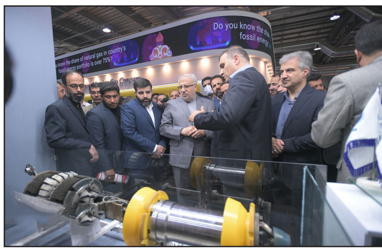
Iran Petroleum Minister Javad Owji pays a visit to the 27th Iran International Oil, Gas, Refining and Petrochemical Exhibition, also known as Iran Oil Show 2023, on Saturday, May 20, 2023.

TEHRAN – Iran's Petroleum Minister Javad Owji on Saturday announced that $12 billion worth of semi-finished oil and gas projects have been completed in the last Iranian calendar year (ended March 20, 2023), and added that Phase 11 of the South Pars Gas Field will be put into operation within the next three months