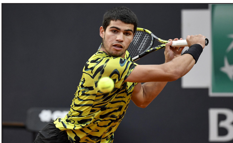
Carlos Alcaraz of Spain returns the ball to Albert Ramos-Vinolas of Spain during their match at the Italian Open tennis tournament, in Rome, May 13, 2023.

Rublev's Russian compatriot Daniil Medvedev will not have that luxury, however, and will seek a first win in Rome when he opens his campaign against Finn Emil Ruusuvuori on Sunday after rain forced play to be suspended late in the evening.