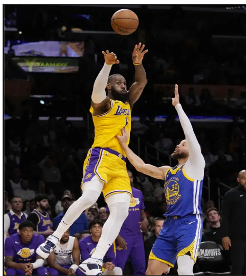
Los Angeles Lakers forward LeBron James passes over Golden State Warriors guard Stephen Curry during the second half in Game 6 of an NBA basketball Western Conference semifinal series Friday, May 12, 2023, in Los Angeles.

James, Davis and the Lakers are the first team since 2014 to eliminate Curry's Warriors from the playoffs before the NBA Finals. Golden State has played in six of the last eight NBA Finals, missing the playoffs entirely in the other two seasons.