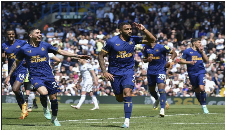
Newcastle's Callum Wilson, center, celebrates with teammates after scoring his side's 2nd goal from the penalty spot during the English Premier League soccer match between Leeds United and Newcastle United at Elland Road in Leeds, England, Saturday, May 13, 2023.

LEEDS, England (AP) - Newcastle dropped more points in its push for Champions League qualification by drawing 2-2 at Leeds, which remained in the Premier League's relegation zone on Saturday.