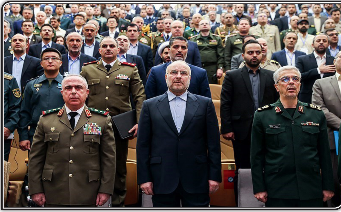
Participants at the opening of the international conference "Geometry of the New World Order" in Tehran stand as Iran's national anthem is played on Wednesday.

TEHRAN -- The chief of staff of the Iranian armed forces said here Wednesday Europe will plunge irreversibly into a downward spiral if it does not manage to throw off the shackles of subjugation to the United States and stop supporting Washington's policies blindly.