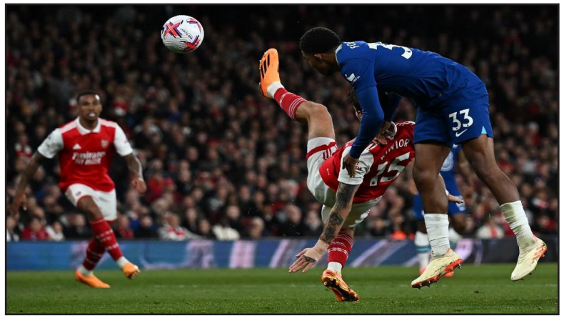
Chelsea's French defender Wesley Fofana (first right) defends a bicycle kick from Arsenal's Polish defender Jakub Kiwior (second right) during the English Premier League football match between Arsenal and Chelsea at the Emirates Stadium, in London, on May 2, 2023.

LONDON (Reuters) - Arsenal returned to the top of the Pre-