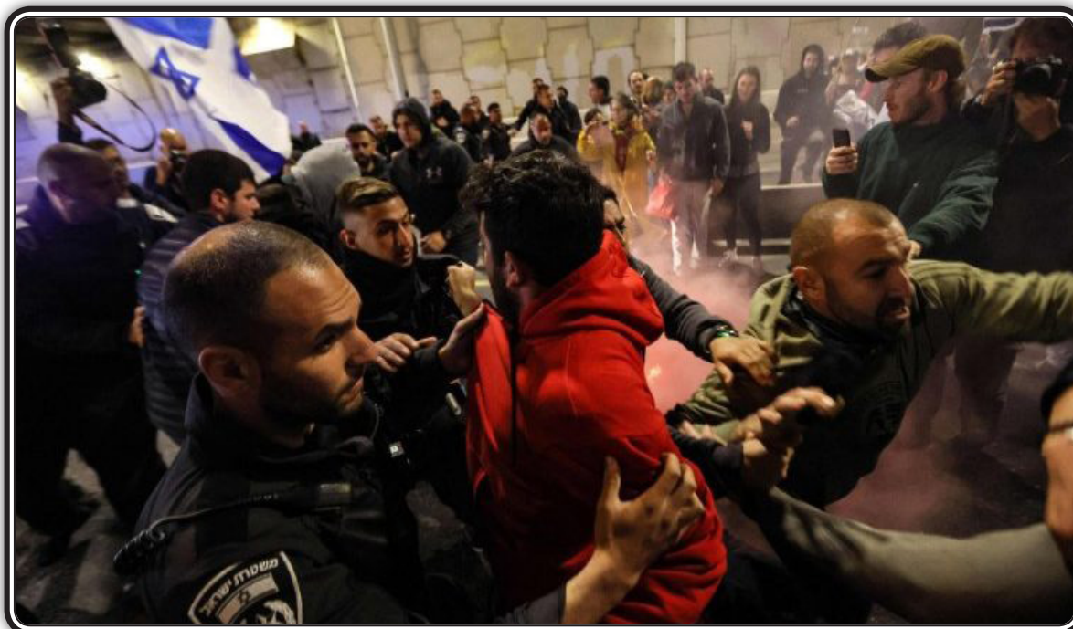
Protesters scuffle with military forces in Tel Aviv during a rally against the occupying regime's controversial judicial overhaul bill.

TEHRAN – Iran's foreign ministry spokesman on Monday cited an article published by an Israeli center about the erosion of the Zionist regime's deterrence capabilities, saying Israel is weaker than a spider's web.