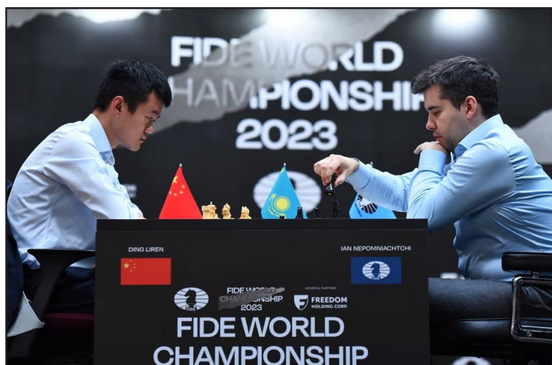
Ian Nepomniachtchi of International Chess Federation competes against Ding Liren of China.

Ding's triumph means China holds both the men's and wom-