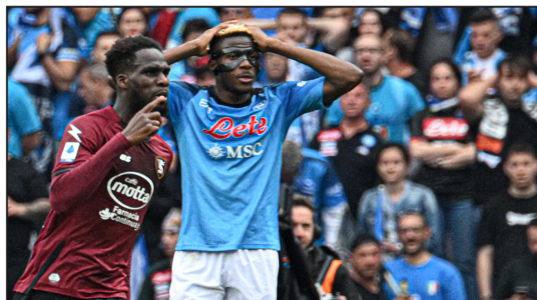
Napoli were held by Salernitana

now only need a single point to emulate Diego Maradona, who led southern Italy's biggest club to their only previous league titles in 1987 and 1990.