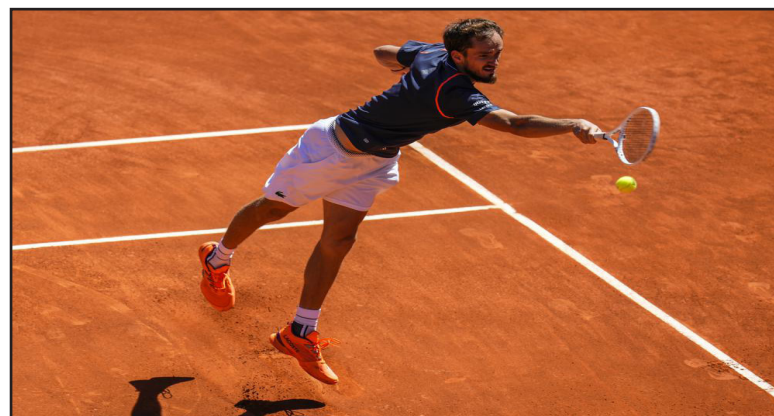
Daniil Medvedev, of Russia, returns the ball to Alexander Shevchenko, of Russia, at the Madrid Open tennis tournament in Madrid, Spain, Monday, May 1, 2023.

MADRID (AP) — Daniil Medvedev had to come from a break down twice in the final set to reach the last 16 of the Madrid Open with a 4-6, 6-1, 7-5 win over fellow Russian Alexander Shevchenko on Monday.