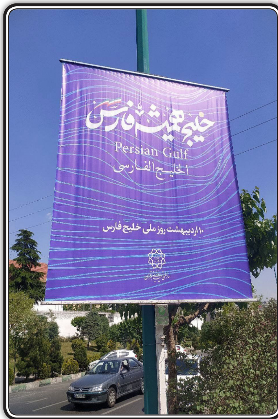
Iranians hoisted banners and placards in front of the and British embassies in Tehran on Sunday to protest their use of fake names for the Persian Gulf.

TEHRAN -- Iranians on Sunday held nationwide ceremonies to celebrate the National Persian Gulf Day, which represents a symbol of the unwavering anti-hegemonic stance of the country as well as dismissal of futile attempts by certain regional countries to rename the strategic body of water.