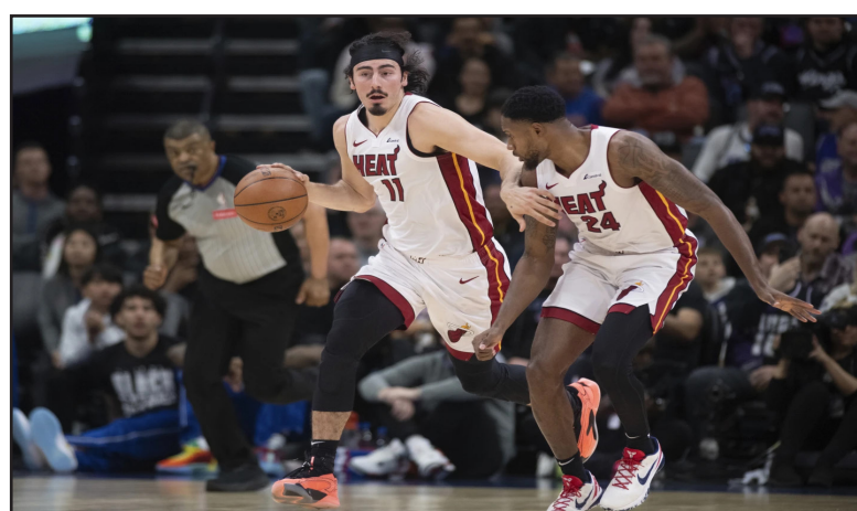
Miami Heat guard Jaime Jaquez Jr. (11) starts a fast break with forward Haywood Highsmith (24) in the first quarter of an NBA basketball game against the Sacramento Kings in Sacramento, Calif., Monday, Feb. 26, 2024.

SACRAMENTO, Calif. (AP) — Bam Adebayo scored 28 points, Jaime Jaquez Jr. added 26 and the short-handed Miami Heat beat the Sacramento Kings 121-110 on Monday night for their fourth straight win.