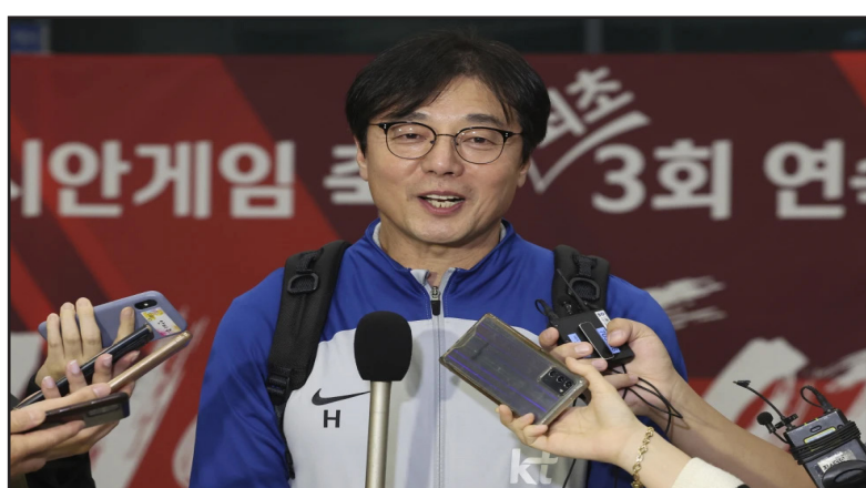
U-23 Korean national team head coach Hwang Sun-hong speaks at the Incheon International Airport in Incheon, South Korea on Oct. 8, 2023. Hwang will take temporary charge of the team for at least two 2026 World Cup qualifiers against Thailand in March, the Korea Football Association said on Tuesday, Feb. 27, 2024.

SEOUL, South Korea (AP) — Jurgen Klinsmann's successor as South Korea coach is former international Hwang Sun-hong.