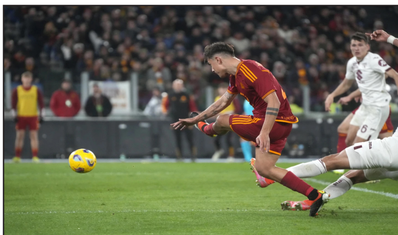
Roma's Paulo Dybala scores his side's third goal during the Italian Serie A soccer match between Roma and Torino at Rome's Olympic stadium, Italy, Monday, Feb. 26, 2024.

Dybala score a splendid second goal after 58 minutes,