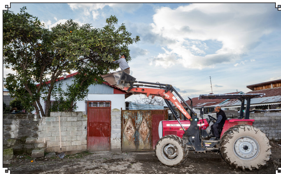
If you are not for the low-hanging fruit, you have to step up, just like these gents in Rezvanshahr in northern Iran to get to the top of the tangerine tree.