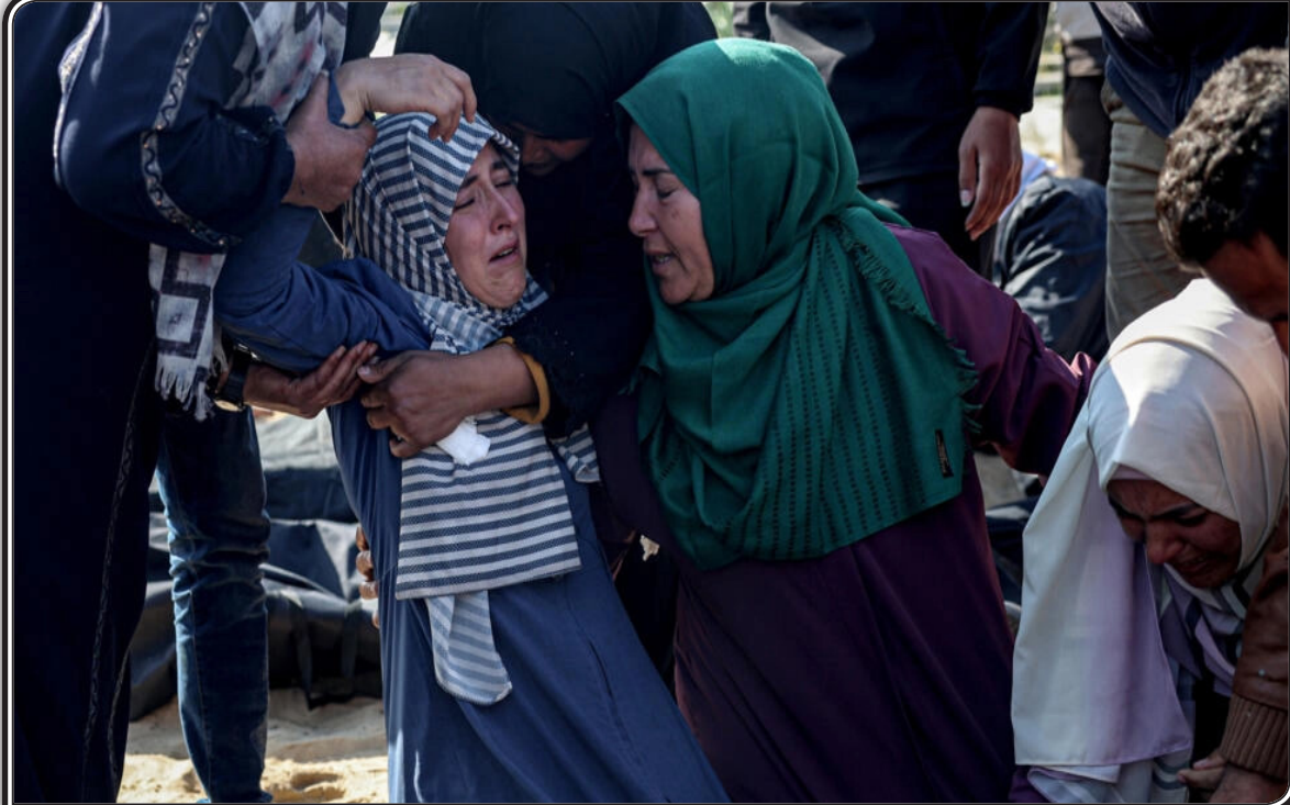
Some 1.4 million people in Rafah now live in crowded shelters and makeshift tents as the Zionist regime plans a full-scale invasion of the area.