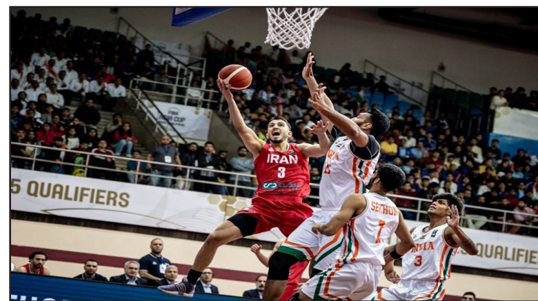
TEHRAN – Iran's national basketball team remained unchanged in the FIBA ranking. Team Melli barely escaped against Qatar at home and took its time getting India out of the way.

It went undefeated through the window drop 3 spots. Next up is the also undefeated Kazakhstan, who Iran lost to twice in the previous Qualifiers. This should be interesting. Iran sits 27th in the standing.