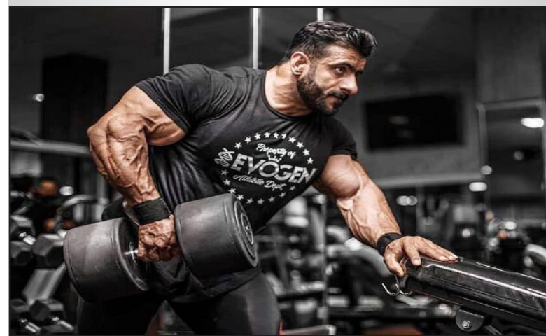
TEHRAN – Iranian bodybuilder Hadi Choopan won the Arnold Classic 2024 Saturday night.

The event saw some tough competitors on stage bring their best packaging that night. However, there was one winner to rule them all, and it was the popular choice among both judges and the audience, Choopan. The competition witnessed a lot of ups and downs between the pre-judging and finals, with many of the bodybuilders presenting improved conditioning later. The battle between Choopan and Samson Dauda divided fans based on their preferences. In the end, even bodybuilding icon James Hollingshead received praise despite getting fifth place. For the additional achievements, Dauda won the Best Poser award for his spectacular routine, while Choopan won the Most Muscular award apart from the main title. Throughout