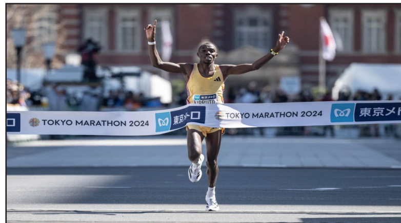
Benson Kipruto of Kenya wins first place in the men's marathon during the Tokyo Marathon 2024 in Tokyo on March 3, 2024.