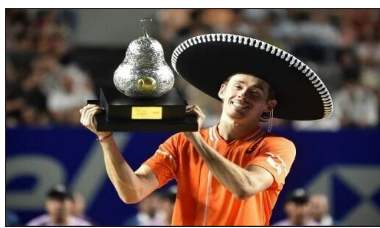
Australia's Alex de Minaur celebrates with the trophy after winning the Mexican Open

ACAPULCO (Reuters) – Third seed Alex de Minaur successfully defended his Mexican Open crown on Saturday, romping to a 6-4 6-4 victory over Casper Ruud in the Acapulco title clash. The result helped the 25-year-old Australian snap a four-match losing run in finals and bag his eighth ATP Tour title - his seventh on hard courts - to secure his place in the top 10 of the world rankings that will be updated on Monday. The world number nine drew first blood for a 2-1 lead in the opening set as sixth-seeded Norwegian Ruud, who battled through tough three-setters against Ben Shelton and Holger Rune in the prior two rounds, appeared slightly off the pace. But like he did in those matches, Ruud responded strongly to