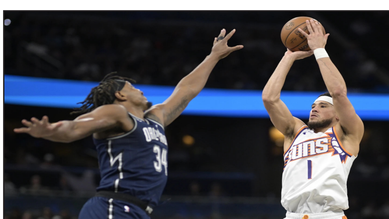
Phoenix Suns guard Devin Booker (1) shoots in front of Orlando Magic center Wendell Carter Jr. during the first half of an NBA basketball game, Sunday, Jan. 28, 2024, in Orlando, Fla.

Booker finished his 21-point third quarter by scoring the Suns' final seven points, but as he sat out the first four minutes of the fourth quarter, the Magic moved ahead.