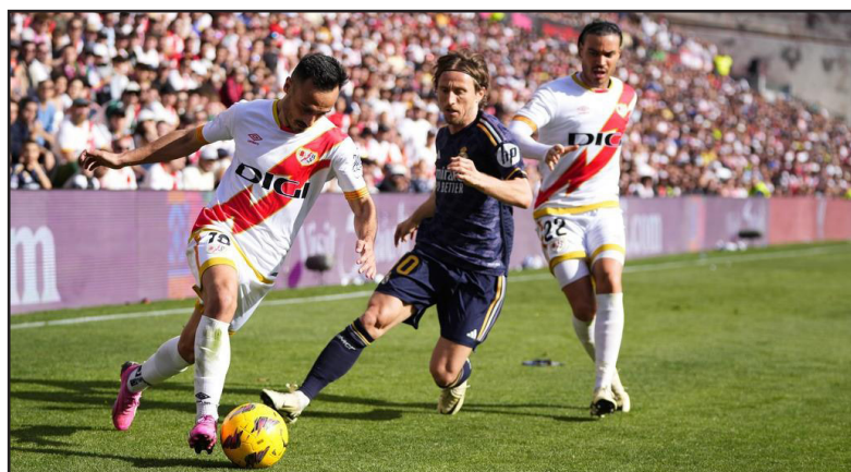
Real Madrid's Luka Modric (center) challenges for the ball with Rayo's Alvaro Garcia during the Spanish La Liga soccer match between Rayo Vallecano and Real Madrid at the Vallecas stadium in Madrid, Spain, on Feb 18, 2024.

MADRID (Reuters) - Real Madrid dropped two points in the race for the La Liga title on Sunday, being held to a 1-1 draw away to Rayo Vallecano.