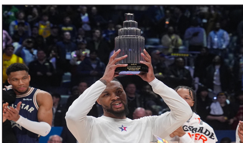
Milwaukee Bucks guard Damian Lillard (0) lifts the MVP trophy after the East defeated the West 211-186 in the NBA All-Star basketball game in Indianapolis, Sunday, Feb. 18, 2024.

"It's hard to play defense when somebody's shooting 30, 40