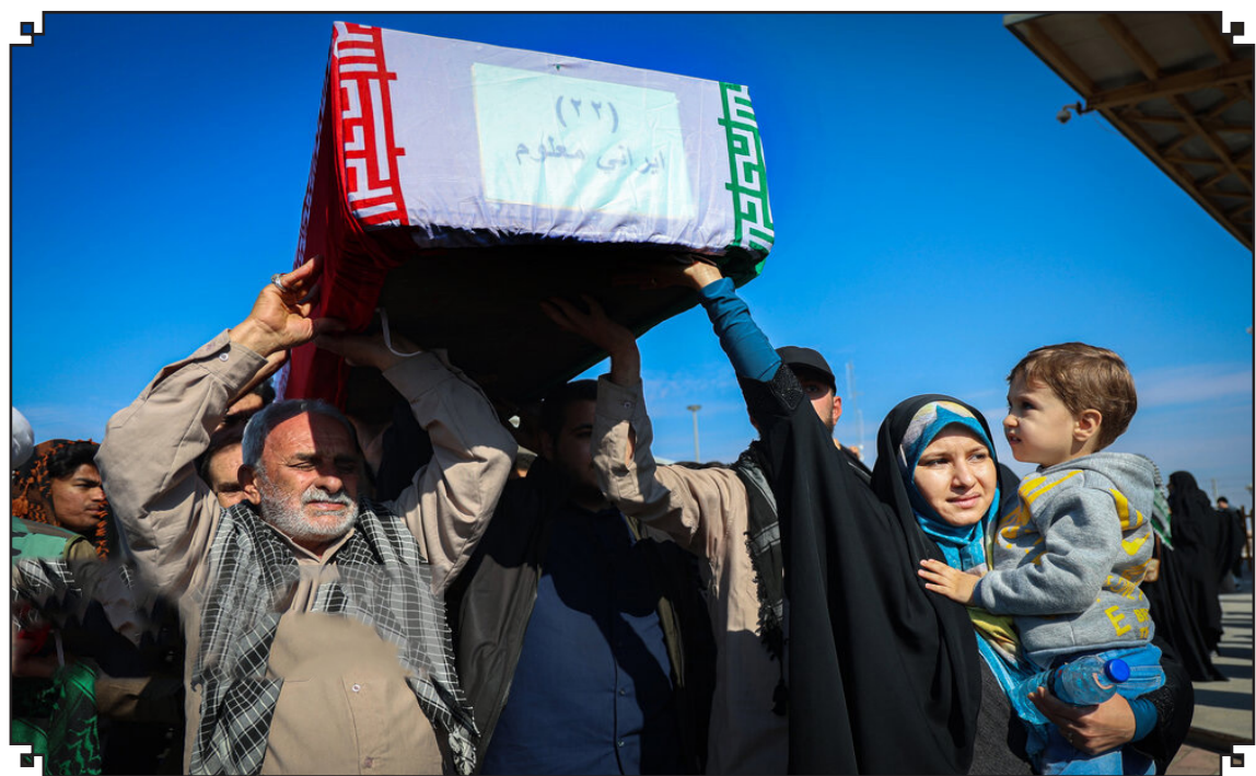
The remains of 34 recently exhumed martyrs of the 1980-1988 Holy Defense were repatriated from the Shalamchek border on Monday morning and received by families of martyrs, war veterans and Iranians from all walks of life.