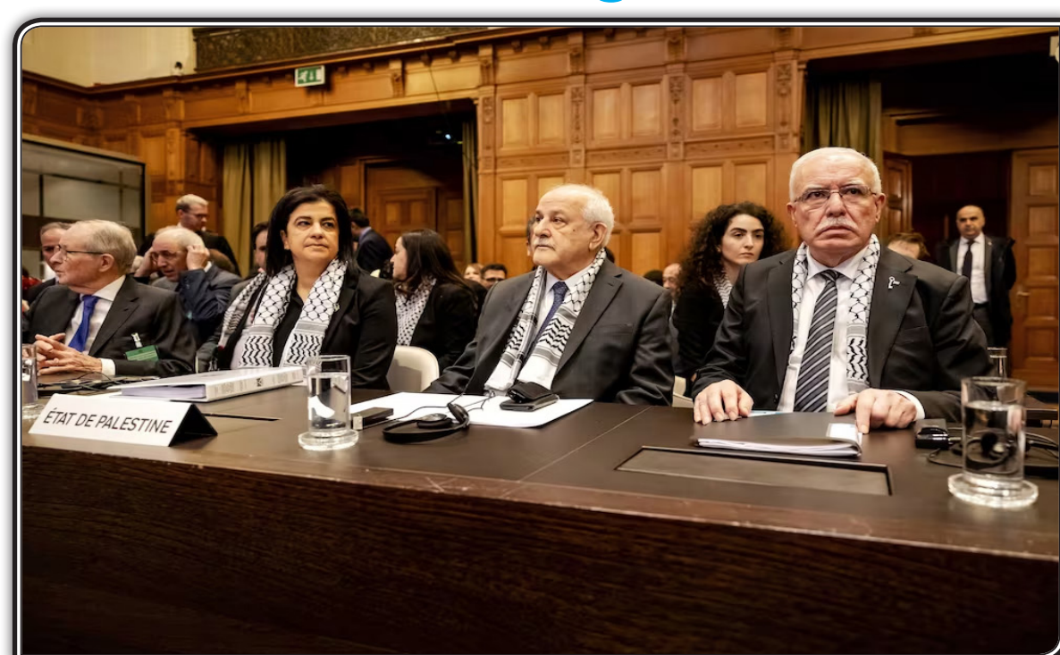
The Palestinian delegation attends the hearing on the consequences of the Israeli occupation at the International Court of Justice in The Hague, The Netherlands on Feb. 19, 2024.

THE HAGUE, Netherlands (Dispatches) -- The Palestinian foreign minister on Monday highlighted Israel's apartheid and urged the United Nations' top court to declare that the regime's occupation of lands sought for a Palestinian state is illegal and must end immediately and unconditionally. The remarks came at historic hearings into the illegality of