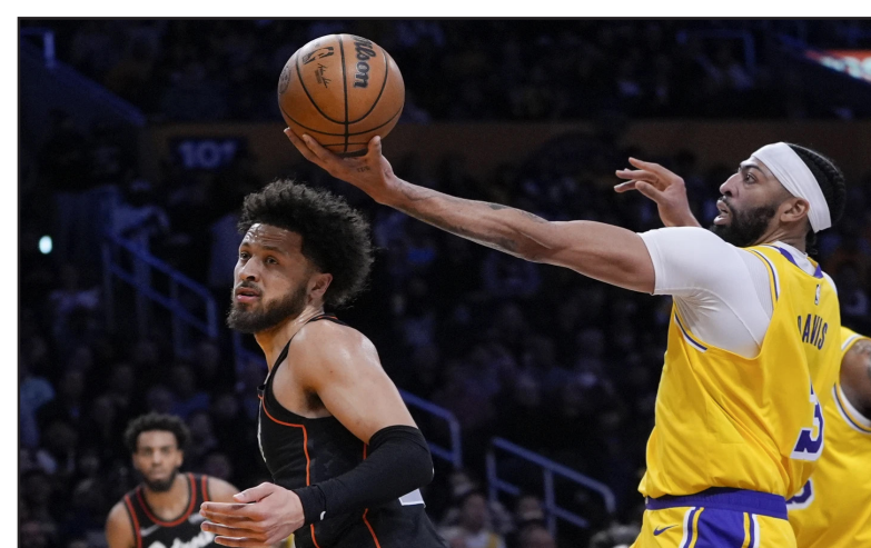
Los Angeles Lakers forward Anthony Davis, right, grabs a rebound from Detroit Pistons guard Cade Cunningham during the first half of an NBA basketball game, Tuesday, Feb. 13, 2024, in Los Angeles.

LOS ANGELES (AP) — LeBron James had 25 points and eight assists, Anthony Davis had 20 points and 14 rebounds, and the Los Angeles Lakers beat the NBA-worst Detroit Pistons 125-111 Tuesday night for their fifth win in six games.