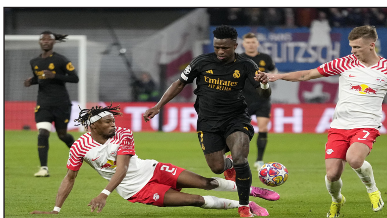
From left, Leipzig's Mohamed Simakan, Real Madrid's Vinicius Junior and Leipzig's Dani Olmo challenge for the ball during the Champions League round of 16 first leg soccer match between RB Leipzig and Real Madrid at the Red Bull arena stadium in Leipzig, Germany, Feb 13, 2024.

LEIPZIG(Reuters) - Real Madrid's Brahim Diaz scored a stunning goal after a mazy run as they won 1-0 at