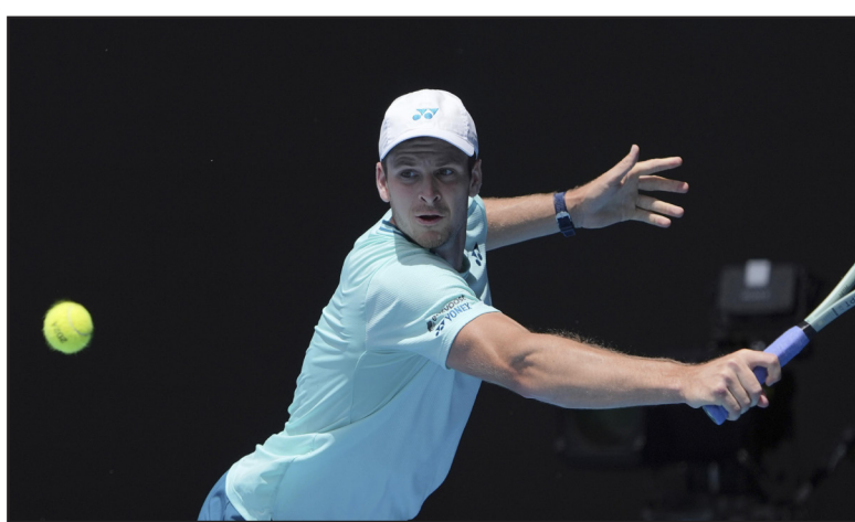
Hubert Hurkacz of Poland plays a backhand return to Daniil Medvedev of Russia during their quarterfinal match at the Australian Open tennis championships at Melbourne Park, Melbourne, Australia, Jan 24, 2024.