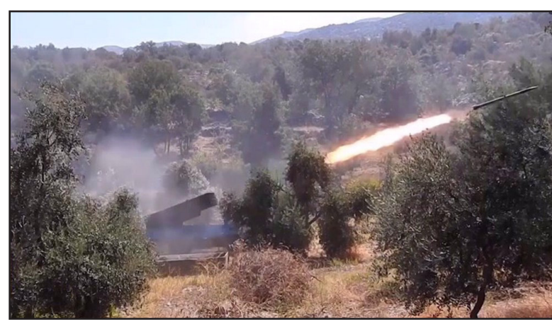
A Hezbollah rocket aimed at a target in the occupied territories is fired from southern Lebanon

BEIRUT (Dispatches) – Fighters from the Lebanese Hezbollah resistance movement have separately targeted espionage equipment and a gathering of Zionist troops stationed at military outposts close to the border between the Arab country and the 1948 occupied territories.