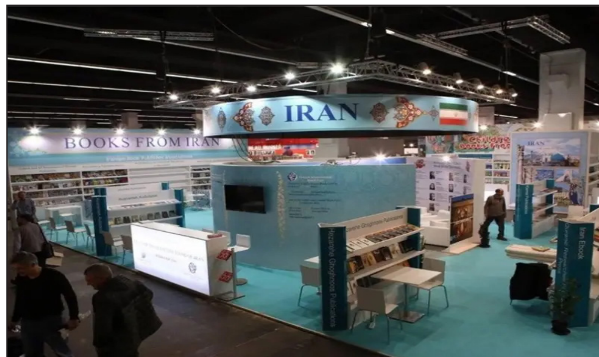
Iran's pavilion at Frankfurt Book Fair, Germany, October 2018.

The fair opened on February 10 and will run by February 18. It is held for the past 50 years as a major calendar event in the pub-