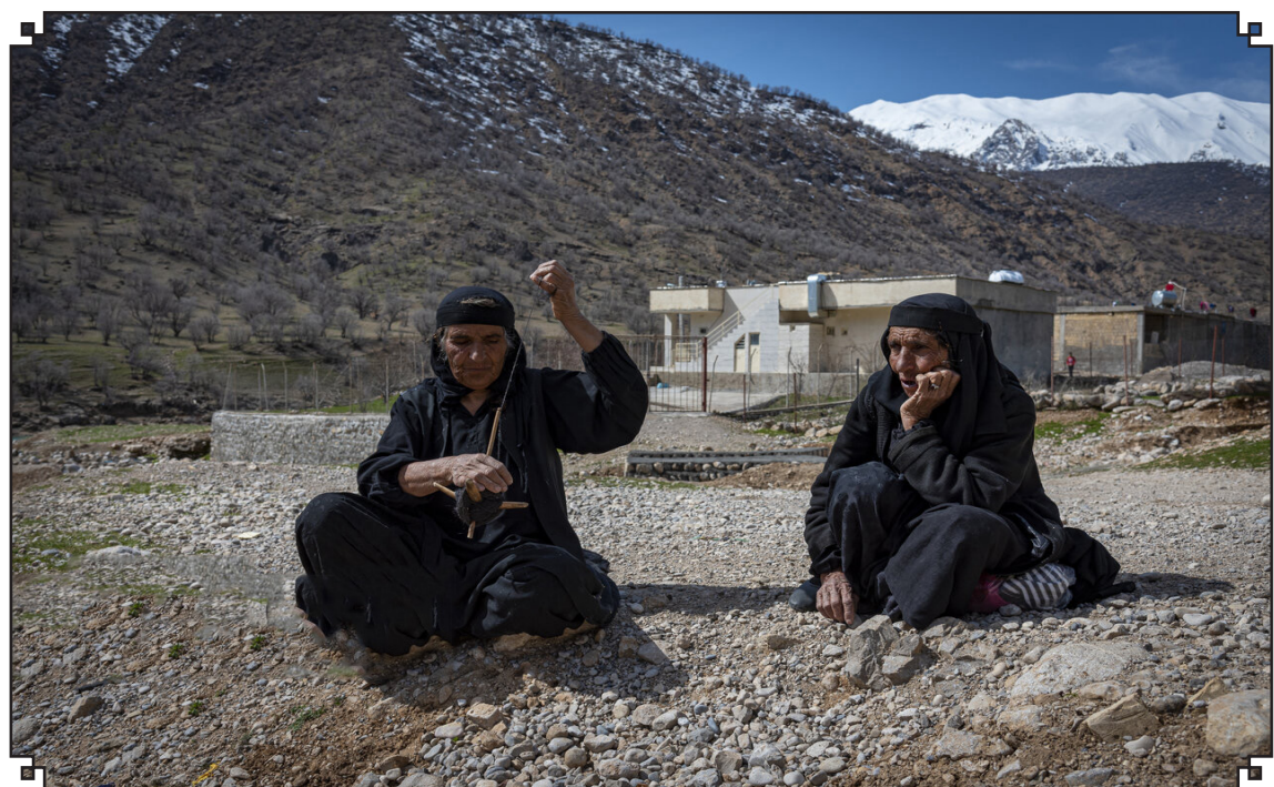
Village life in Chaharmahal and Bakhtiari. February 9 is recorded in Iran's official calendar as Chaharmahal and Bakhtiari Day.