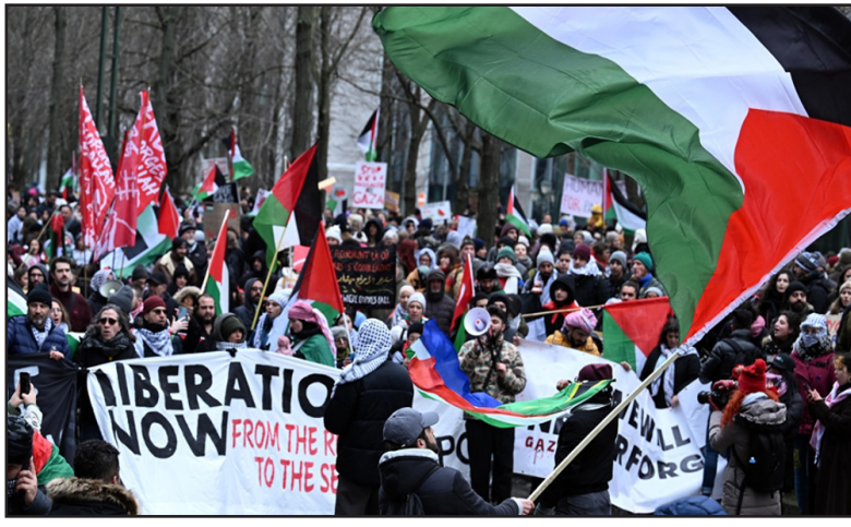
Thousands of demonstrators took to the streets of Brussels, Belgium, on Sunday to demand an immediate ceasefire in the Gaza Strip.

“So the point (of the protest) is to insist on the fact that there is no military solution to this conflict, which has led to far too many deaths and which has created an unprecedented humanitarian catastrophe. Now is the time for Belgium and the European Union to say that not only this war must end [and] there must be a ceasefire, but also we must take action to force Israel to end its murderous offensive, which is directed not against Hamas but against the