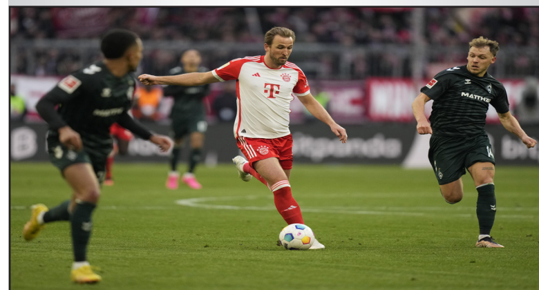
Bayern's Harry Kane (center) is in action during the German Bundesliga soccer match between Bayern Munich and Werder Bremen at the Allianz Arena stadium in Munich, Germany, Jan 21, 2024.

MUNICH (Reuters) - Bayern Munich slumped to a 1-0 home loss to Werder Bremen after a Mitchell Weiser goal to stay seven points adrift of leaders Bayer Leverkusen in the Bundesliga title race.