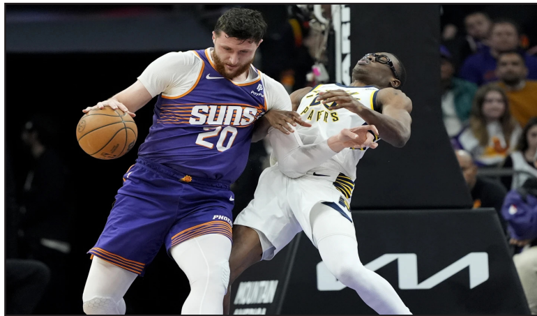
Phoenix Suns center Jusuf Nurkic (20) fouls Indiana Pacers forward Jalen Smith during the first half of an NBA basketball game, Sunday, Jan. 21, 2024, in Phoenix

roster has been whole. It's no coincidence that the team's in the midst of a five-game winning streak.